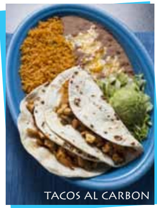
TACOS AL CARBON

flour tortillas filled with pan-seared steak or chicken breast, poblano & onion steak 9.99 chicken 8.99